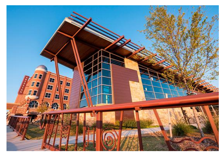
The Chicasaw Visitor Center in Sulphur, OK would make a wonderful spot for a lunch break.

5:00 PM Teams arrive in Ponca City, Oklahoma