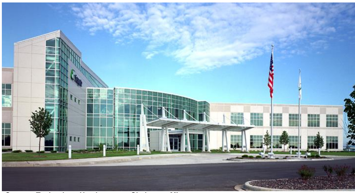
Seagate Technology Headquarters, Shakopee, Minnesota

NOTE: Teams will be waived through the Finish Line with a checkered flag. After appropriate handshakes and photos, teams will trailer their solar cars for transport to the St. Thomas Academy Parking Lot in Mendota Heights, MN.